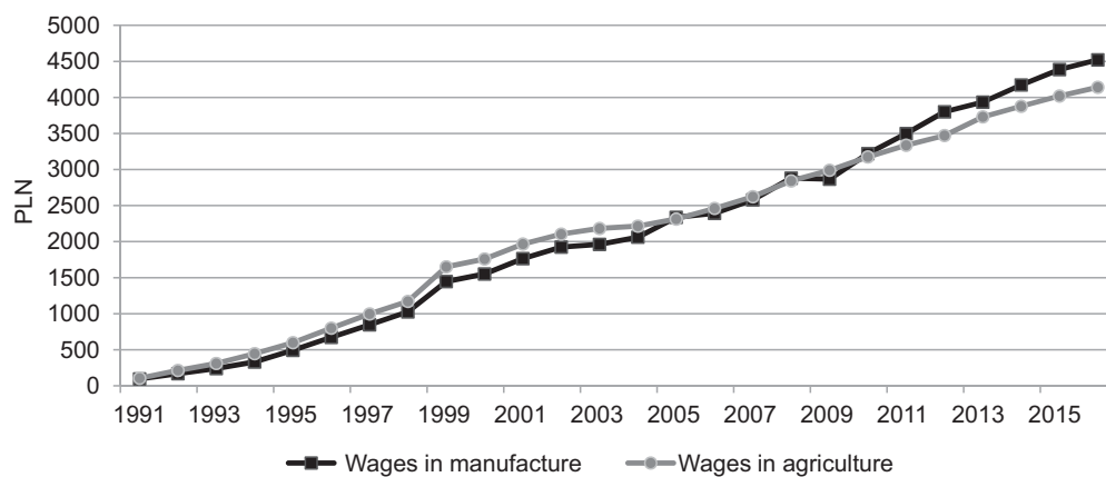
Fig. 2. Average real wages in manufacturing and agricultural sector in the period 1991–2016